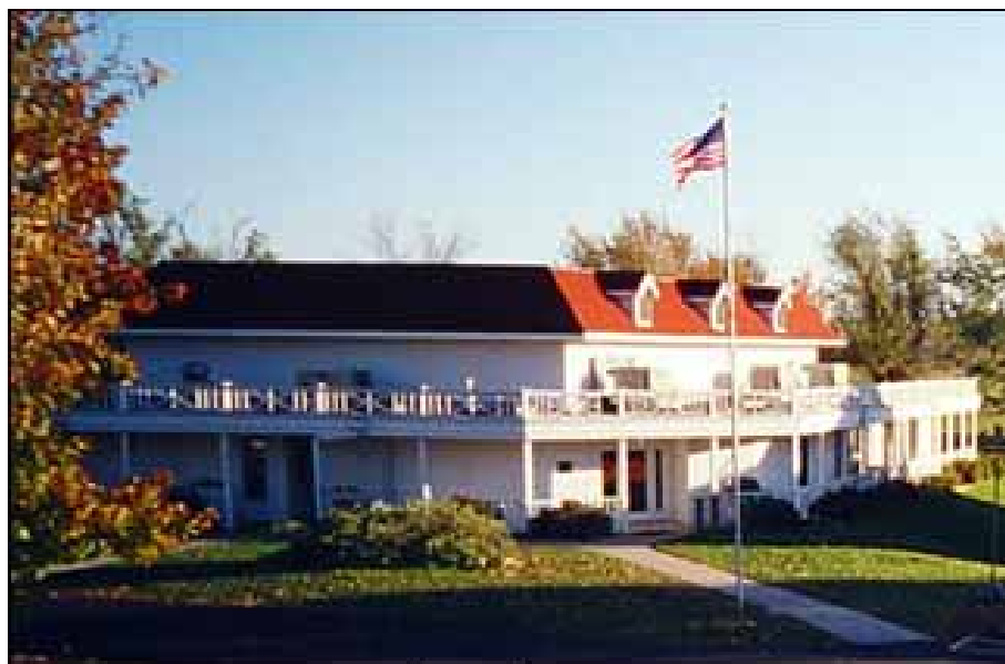
▲ The My Day program is located in Immacolata Manor's Broadacres building on the Manor's grounds in Liberty, Mo.

When the ladies arrive at My Day, they exercise by either riding a stationary bike or walking on a treadmill. After they finish, they have different sensory activities such as fishing, attend-