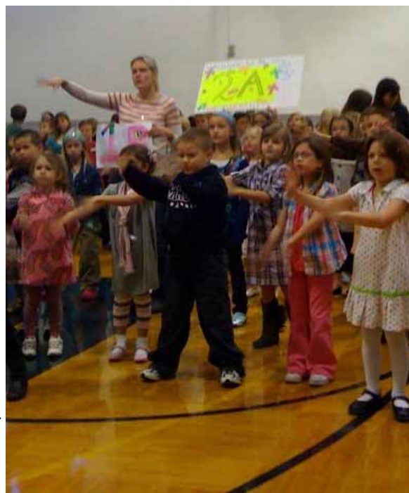
Kids in the Religious Education program open each class session with 15 minutes of prayer and song.