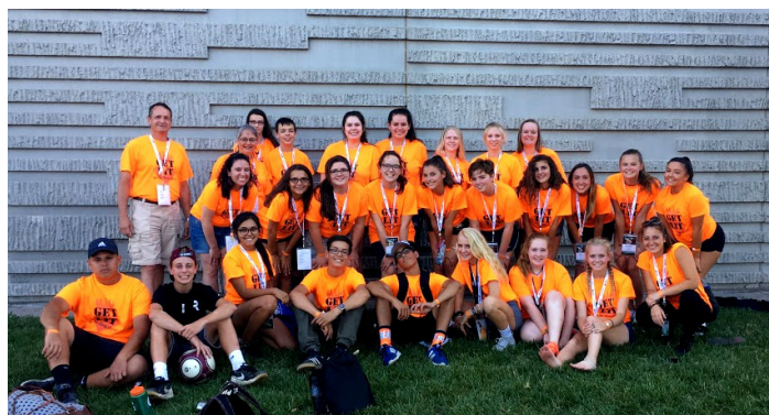
We Went to Steubenville !

YOUTH GROUP MEETS THIS SUNDAY, AUGUST 20 7:00 - 8:30PM COME JOIN US For Fellowship and Fun