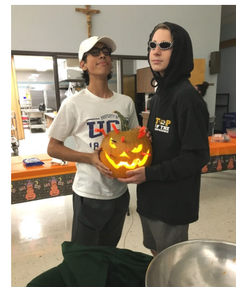
We Had An Awesome Halloween Party On October 29

Come and Join Us For Living In Truth Youth Group THIS SUNDAY After the 6:00 Mass All High Schoolers Are Welcome To Enjoy . . .