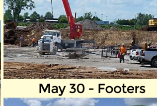
June 18 - Pouring Concrete