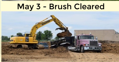
May 16 - Disposing of Dirt