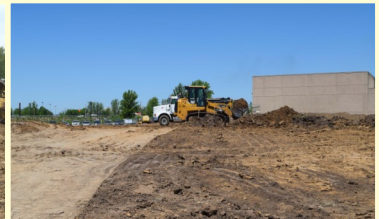
May 9 Leveling the Hill