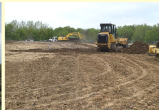
May 9 Grading Begins