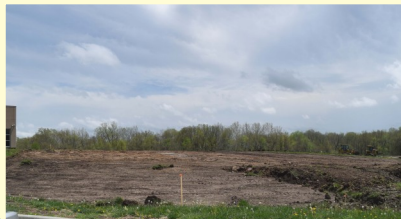
May 3 - Brush Cleared