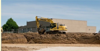
May 10 - Site Cleared