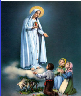
The Blessed Virgin Mary appeared to 3 shepherd children in Fatima, Portugal on the 13th day of six consecutive months, beginning in May 1917.

Join Us on Saturday, August 4 for the 4th of The Five First Saturdays Devotion