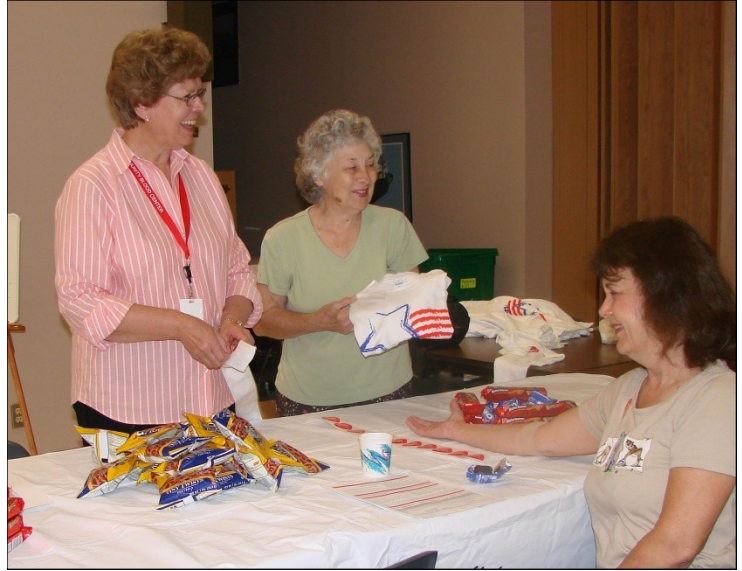
Blood Drive at St. James.