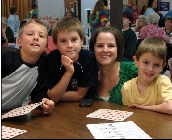
St. James Youth are our future