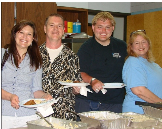
We are a community of volunteers.