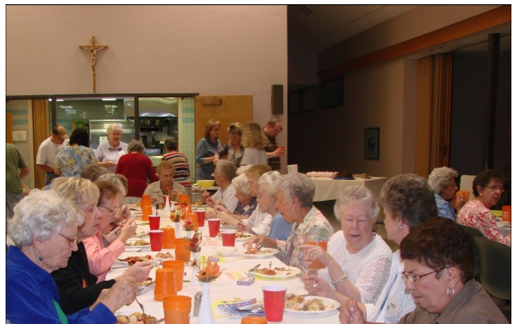
The Over 50s Lunch Crowd.