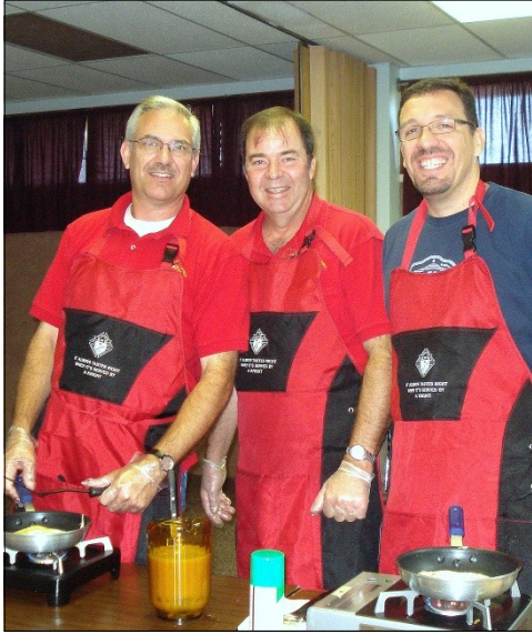
Knights of Columbus on kitchen duty.