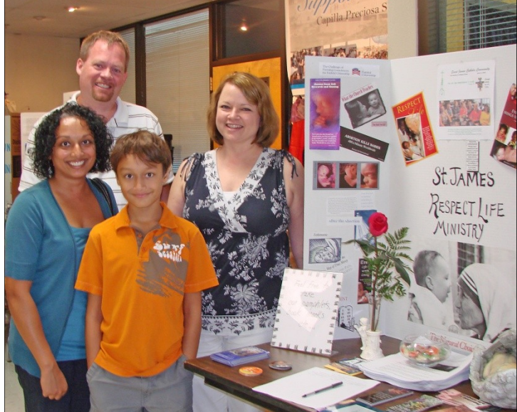
Our Ministry Fair draws all ages