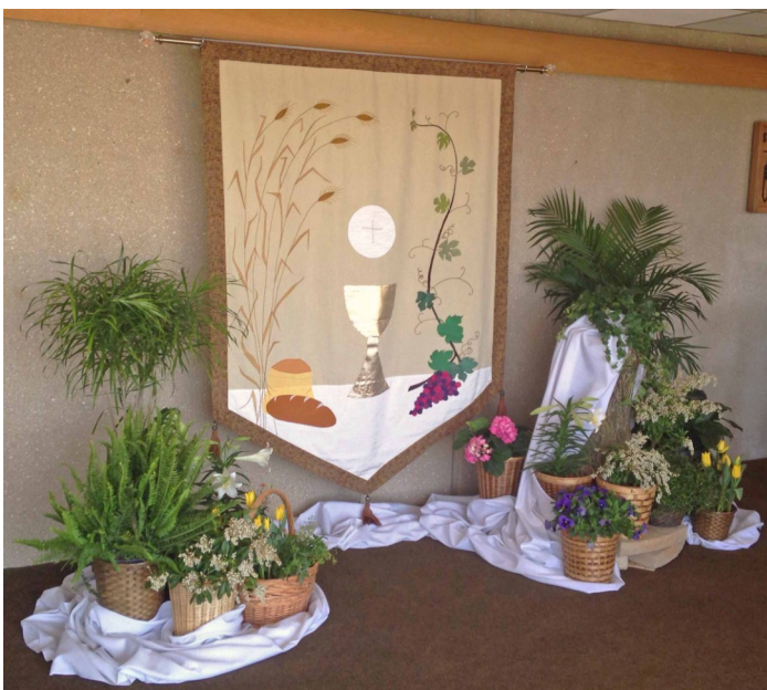
Easter Decorations in the Narthex