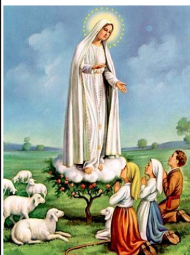
The Blessed Virgin Mary appeared to 3 shepherd children in Fatima, Portugal on the 13th day of six consecutive months, beginning in May 1917.

Subsequent First Saturdays Devotion Will Be Held On ... June 6, July 4, August 1, and September 5