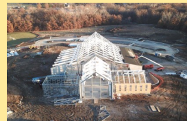
Dec. 1 Aerial View