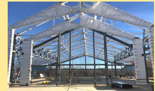
Dec. 17 Beams Are Wrapped