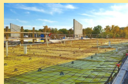
Oct. 30 Laying the Rebar