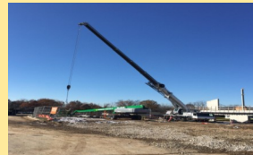
Nov. 14 Setting the Steel