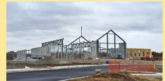
Nov. 20 The Steel Skeleton