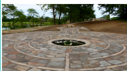
The Labyrinth at the Precious Blood Renewal Center

Celebrate World Labyrinth Day May 4 ~ 11am - 2pm