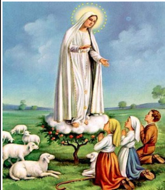
The Blessed Virgin Mary appeared to 3 shepherd children in Fatima, Portugal on the 13th day of six consecutive months, beginning in May 1917.

Join Us on Saturday, May 4 for the 1st of The Five First Saturdays Devotion